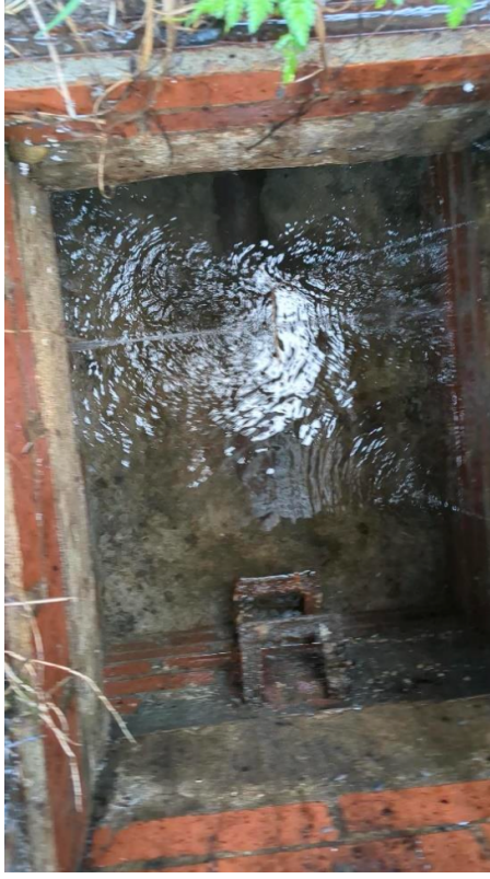
private manhole chamber