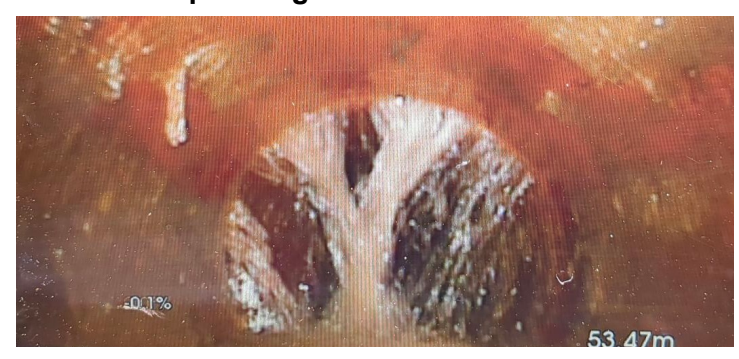
public sewer pipe joint